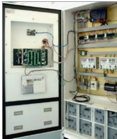
▲ This package has an optional door-mounted controller and digital display

We can package most manufacturer's RTU's or PLC's. Just ask us about yours.