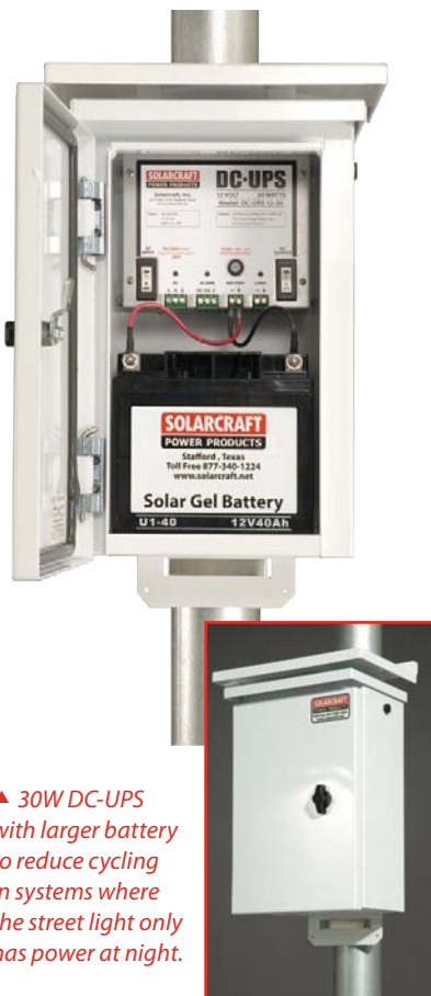
▲ 30W DC-UPS with larger battery to reduce cycling in systems where the street light only has power at night.