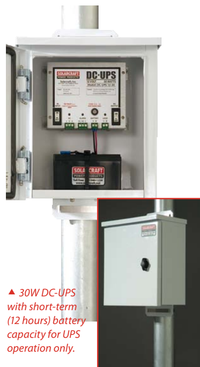
▲ 30W DC-UPS with short-term (12 hours) battery capacity for UPS operation only.